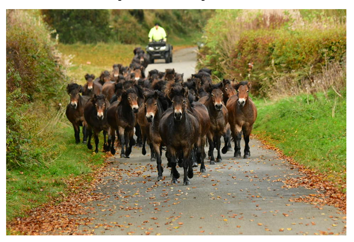
Gathering the Anchor herd coming home down the road

Life on Exmoor continues in our farm work bubble, we are lucky so far to be unaffected by the nasty illness. The sheep lambed and cows calved as normal, we did have a set of Angus twins who lost their mum but took to the bucket easily and are thriving now.