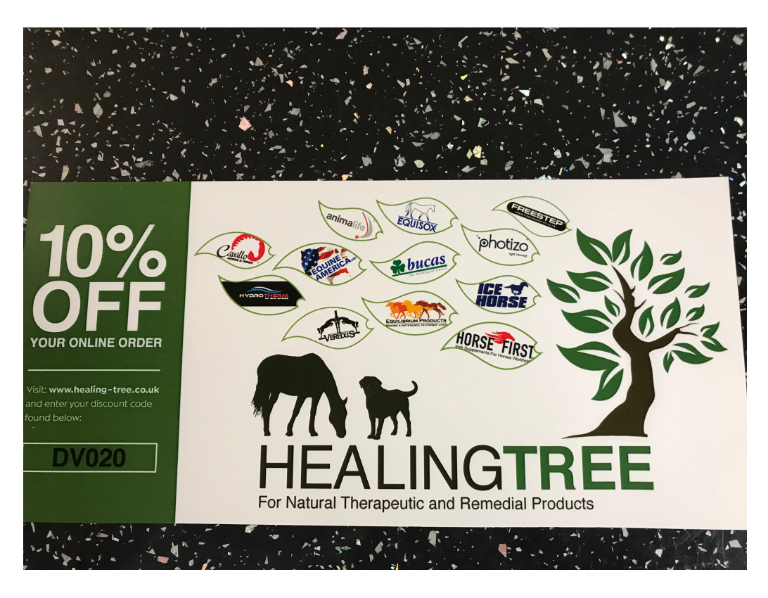
Healing Tree Natural & Remedial Products www.healing-tree.co.uk