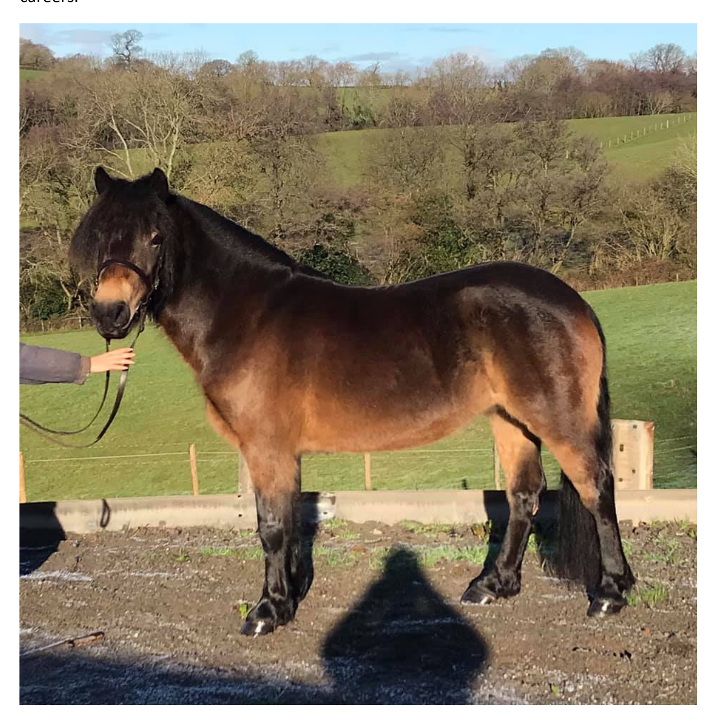
Anchor Lovestory: sold in June after a bloodline consolidation of the herd

We decided to sell a few outstanding youngsters and a couple of good foundation mares and even a stallion have gone to new homes to breed or be handled for future ridden careers.