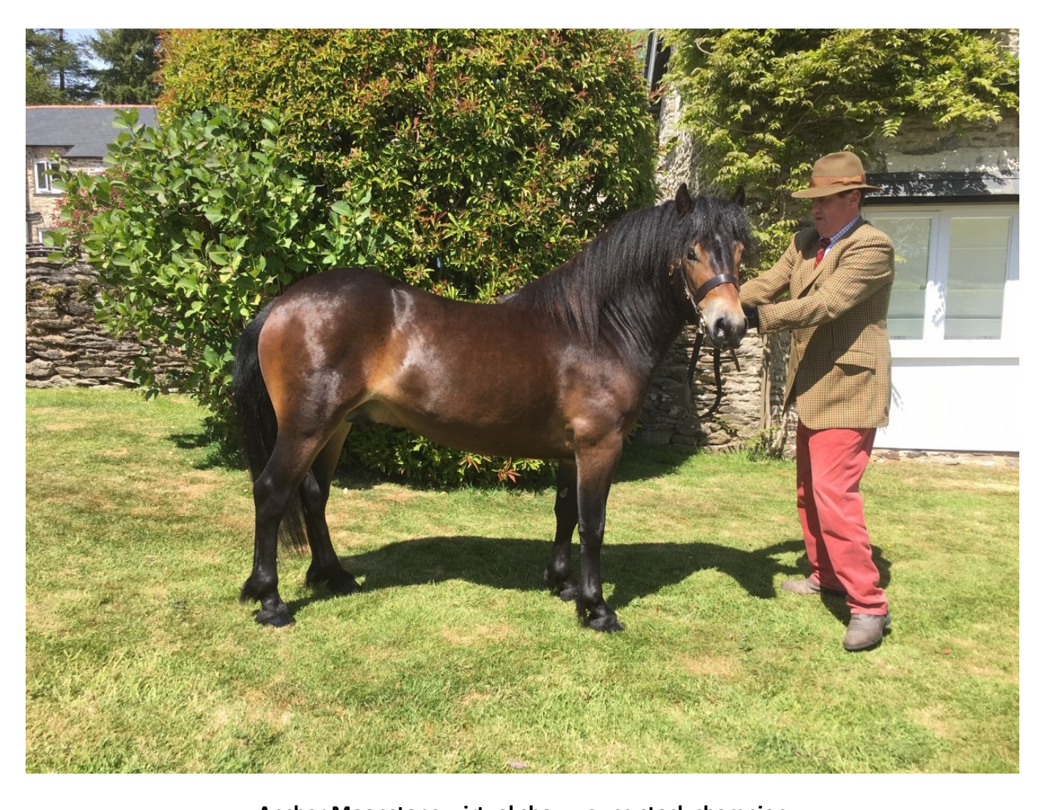
Anchor Moonstone: virtual show young stock champion