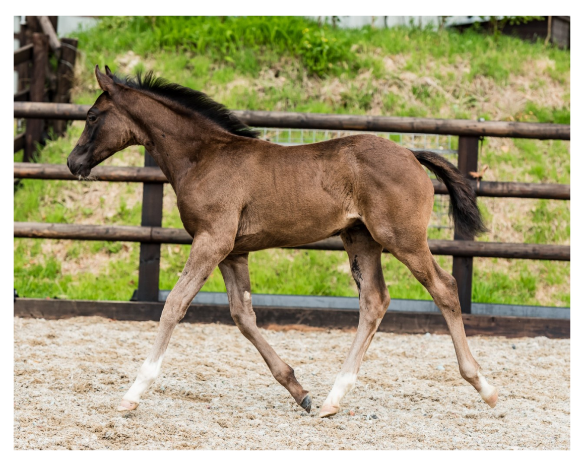
The foal by Geminis Classic Opera out of riding horse mare ABC RiKKI Zee