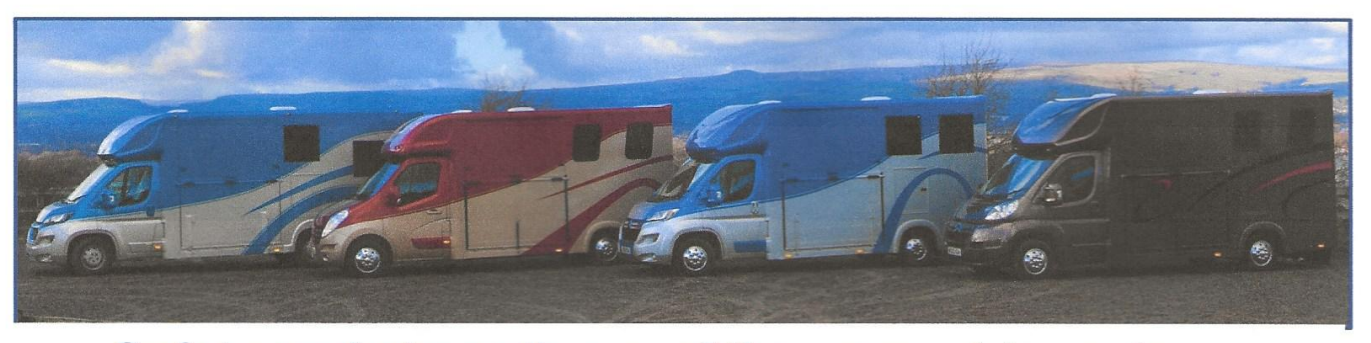
Safety and strength are of the upmost importance throughout our build.

Topline Horseboxes is a small family run business with over 25years experience manufacturing quality horseboxes.